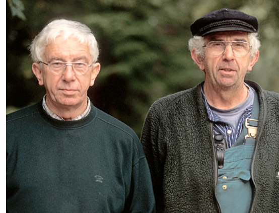
Managers and driving force of the Aschauteiche and innovators in the branch: the Heese brothers.

The trial set-up was commissioned in December 2000 and replaced by the final plant in September 2001. Following a run-in phase of approx. one month the COD was degraded by 80 % and the nitrogen by 95 %. The inflow pollution load with COD was 2000 mg/l and with nitrogen 120 mg/l. As a preliminary settling stage