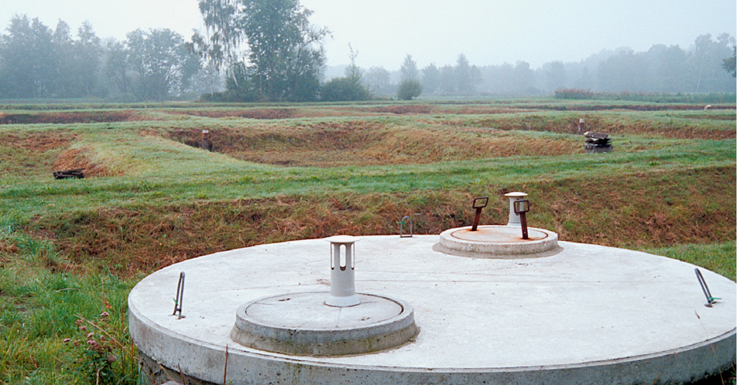
Wastewater treatment plant in the Aschauteiche fish farming enterprise using the AQUAMAX® GASTRO

the clarified water pump On commissioning the surplus sludge from the trials plant was pumped into the SB reactor for the seeding of the biology.