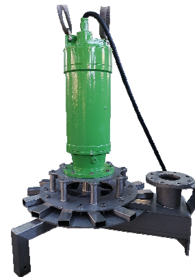
Type HBA without extension channels

The impeller rotating inside the mixing chamber aspirates water through the opening between the motor and the stainless steel body of the unit. By accelerating the water radially 360° through the outlet channels a vacuum is created inside the mixing chamber. This vacuum induces a flow of air into the chamber from above the water level through the aspiration pipe. This aspirated air is mixed with the water to very fine bubbles inside the mixing chamber and then ejected through the outlet channels. The strong density induced flow creates a perfect mixing pattern and oxygen distribution in the tank. Extension channels (option type -C) will optimize oxygen transfer and oxygen distribution.