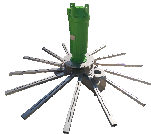
Type HBA-C with extension channels